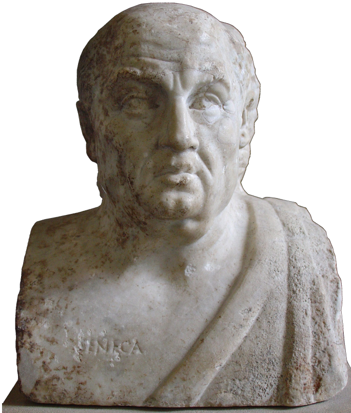
Seneca (4 BC - 65) Aurelius (121-180)