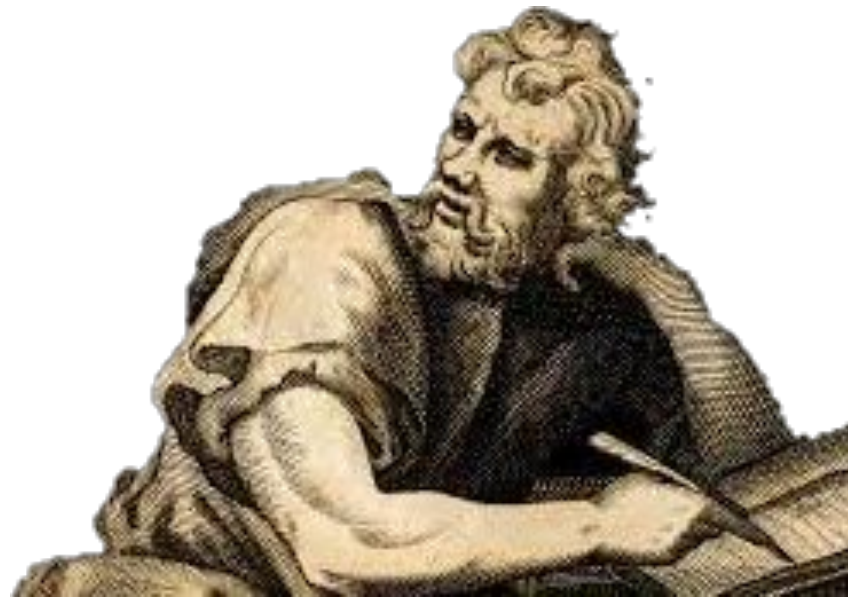
Epictetus (55 - 135)